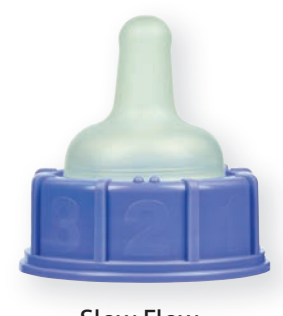
Slow Flow MEPA 0105

"With such a wide range of teat sizes and flow rates, the Mum and I can choose the teat that best suits the baby's drinking technique.