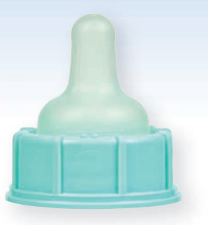
Extra Fast Flow MEPA 0118