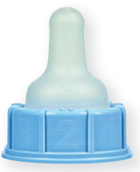
Extra Fast Flow MEPA 0115