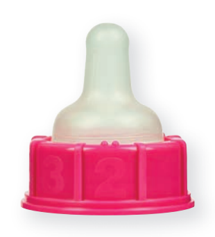
Slow Flow MEPA 0103