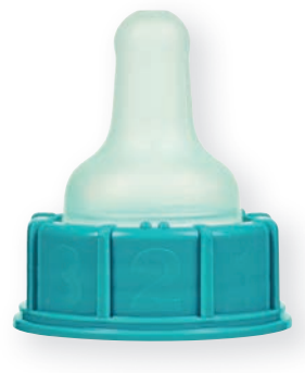
Slow Flow MEPA 0101