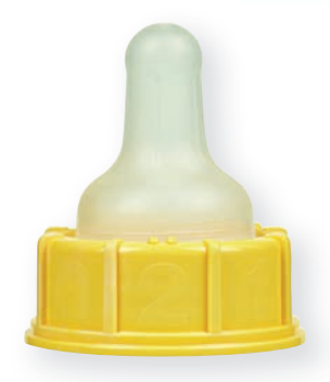
Fast Flow MEPA 0102